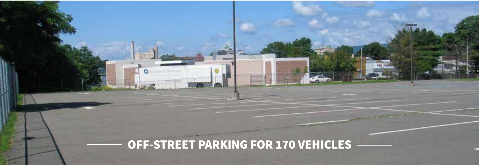
OFF-STREET PARKING FOR 170 VEHICLES